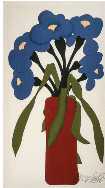
15. Howard Smith for Valilla Blue Irises, 1978 Stretched cotton textile Courtesy National Nordic Museum Photo: Jim Bennett Photo