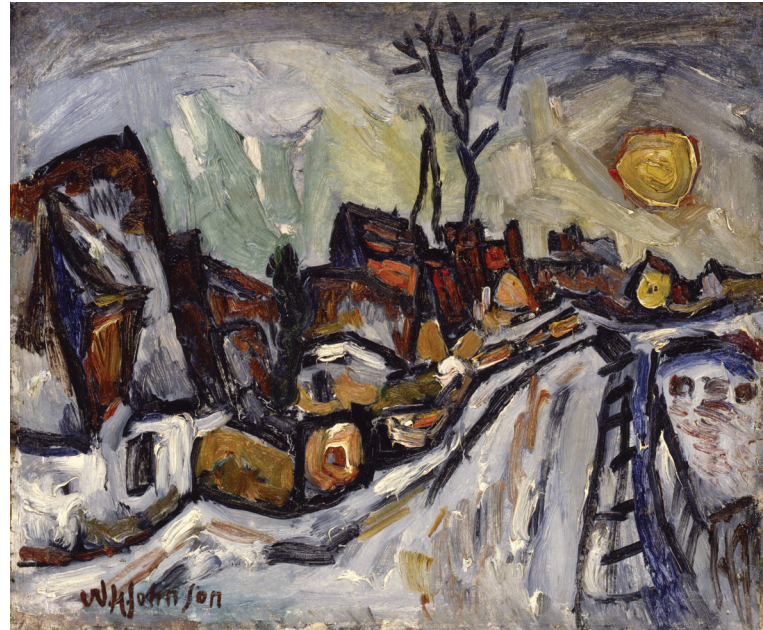
13. William H. Johnson Sunset, Denmark , ca. 1935 – 1938 Oil on canvas Smithsonian American Art Museum, Gift of the Harmon Foundation