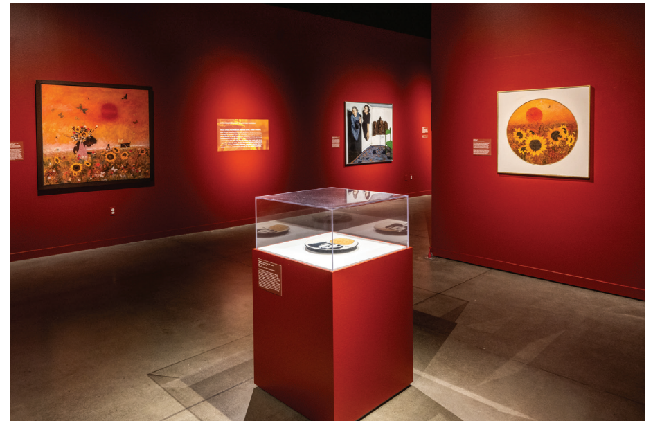
17. Installation view of Nordic Utopia? at National Nordic Museum, Spring 2024