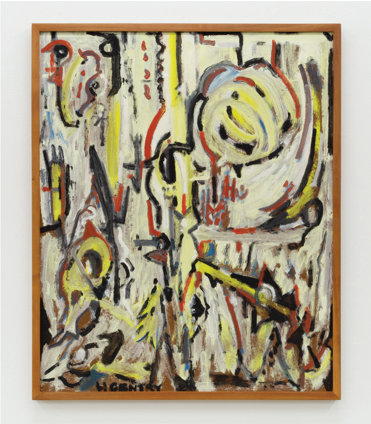
12. Herb Gentry Untitled , 1961 Oil on panel © Herbert Gentry Courtesy of the estate of the artist and RYAN LEE Gallery, New York