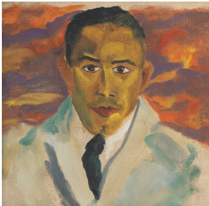
1. Kirsten Kjær Portrait of Roy De Coverley , 1933 Oil on canvas

Scandinavia House | 58 Park Avenue, New York, NY 10016