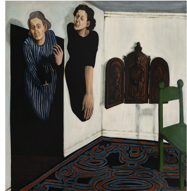
5. Ronald Burns, Surreal Composition/Floating Women , 1966 Oil on board