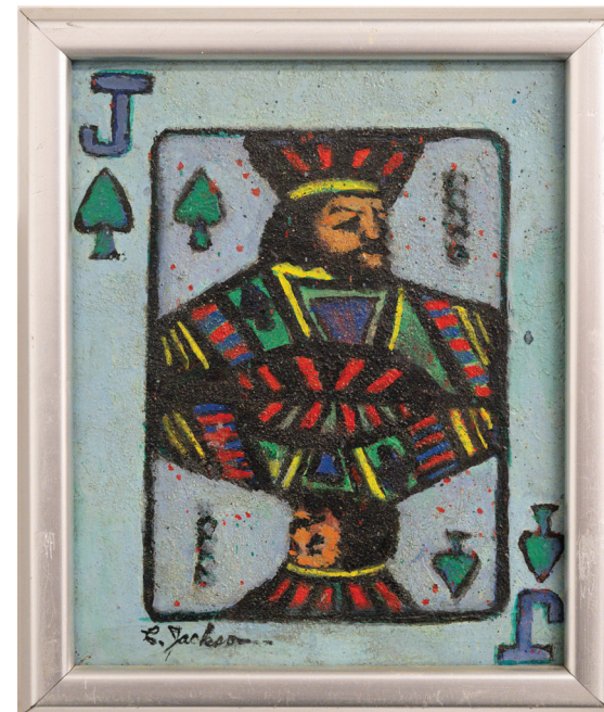
2. Clifford Jackson, Kung av klubbar , n.d. Oil on panel