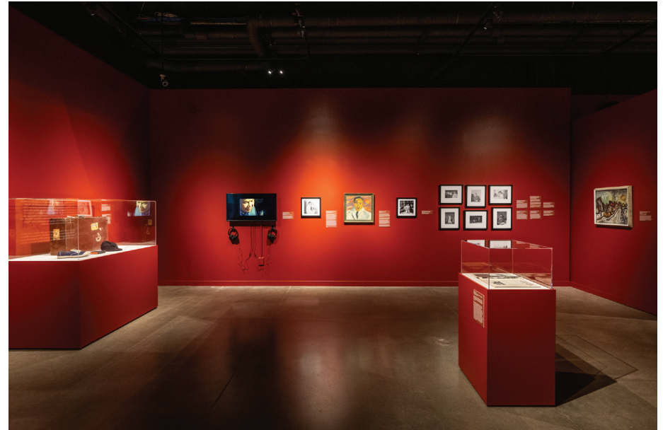
18 & 19. Installation views of Nordic Utopia? at National Nordic Museum, Spring 2024