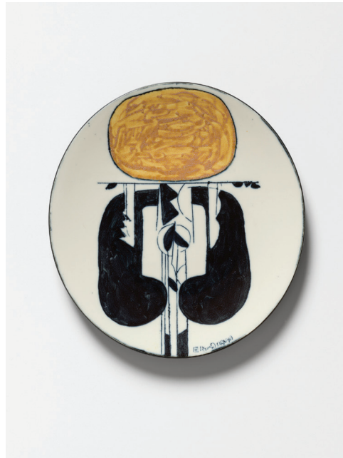
4. Howard Smith for Arabia Calligraphy , 1986 Stoneware