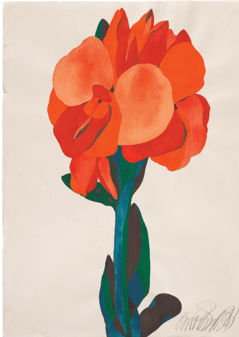
3. Howard Smith Untitled , 1971 Watercolor on handmade paper