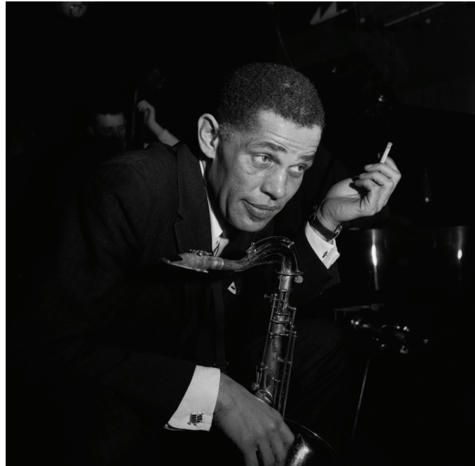
7. Kirsten Malone, Dexter Gordon at Jazzhus Montmartre in Copenhagen, Denmark, 1964 Gelatin silver print from original